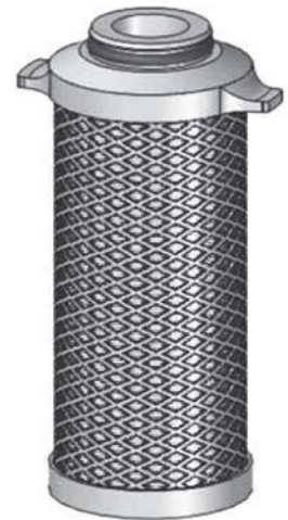
Depth filter AX