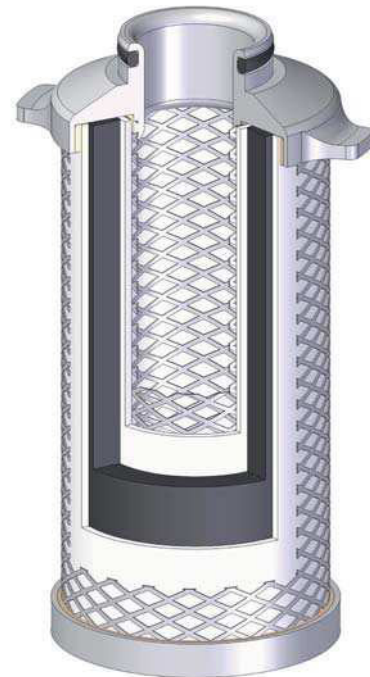
Cross section of the depth filter AX

The specified performance data for the achievement of the compressed air quality classes according to ISO 8573-1 were validated according to ISO 12500-2.